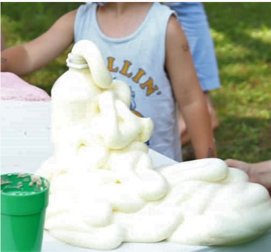
Top Photo: Guiding Eyes puppies in training spent the morning with us during storytime. Bottom: Making elephant toothpaste during summer reading.

"The Tween/Teen subscription kit is such a wonderful idea. Tween, that interesting time when you aren't the cute little one, but aren't a teenager. A time you want to feel included and cared about. This program has been so wonderful...The time Melanie takes to meet reading levels and interests of each child have been so wonderful. Next add in a great craft idea, that gives him something special to create. The icing on the cake is a special edible, just for him! He loves the program, and eagerly looks forward to the next month's!" -Tween/Teen Subscription Kit Participant's Mom