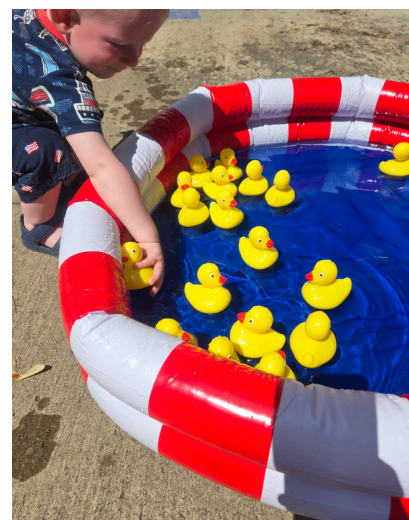
Photos from summer reading. 1.) Spoon ring class for teens and adults; 2.) Author Doogie Horner; 3.) Fun that Pops Magic Show, 4.) Tie Dying Teddy Bears; 5.) Storytime fun